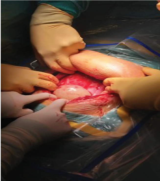
Figure 1. Amniotic sac protruding into the abdominal cavity.

second layer was also continuous unlocked and imbricated the first. The tubal ligation was performed at the patient's request. The patient had an uncomplicated recovery with normal postpartum bleeding and a postoperative hemoglobin level of 9.80 gr/dl (from a preoperative level of 10.30 g/dl). The mother and newborn were discharged three days later in good health and without complications. One year later an expert sonographer meticulously conducted the ultrasound assessment of uterine scar utilizing a multifrequency transvaginal probe ranging from 5.0 to 9.0 MHz of GE Voluson E10 ultrasound machine (GE Medical Systems, Zipf, Austria). A small isthmocele and a residual myometrial thickness (RMT) of 2 mm were found (Figures 2,3).