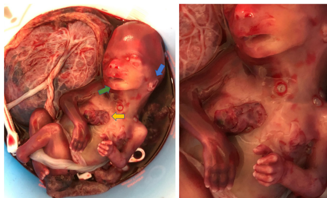
Figure 3. Isolated thoracic ectopia cordis with anterior chest wall defect (yellow arrow), ear cups with slightly low insertion (blue arrow), micrognathia (green arrow) seen after abortion.

mm, and the left lung was 21 mm (base) x11 mm (height). The ectopic heart appeared to be rotated posteriorly with consequent slight torsion of the aorta and pulmonary artery; a macroscopic examination did not reveal other malformations. A 10 mm long funnel adhered to the foetus with false knots, and a placenta with mild deciduous inflammation was observed.